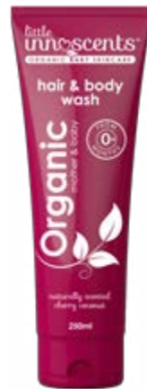
Cherry Coconut Hair & Body Wash RRP $12.99