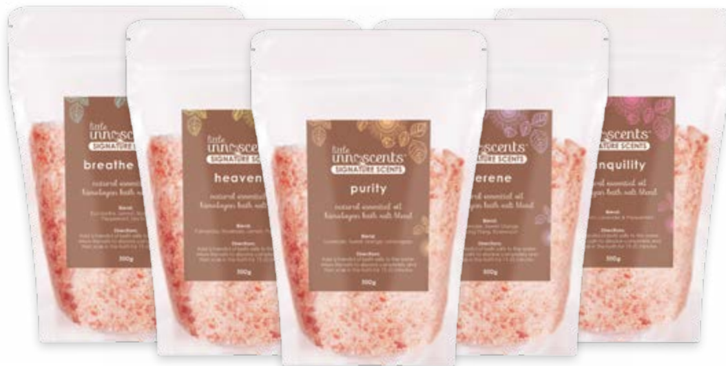
Himalayan Bath Salts (5 types) RRP $25.00