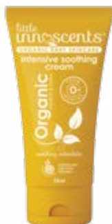
Intensive Soothing Cream RRP $10.99