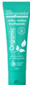
Milky White Toothpaste RRP $4.99