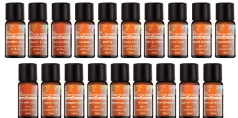
Essential Oil Blends & Pure Essential Oils RRP $12.00 - $20.00