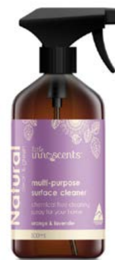
Multi-purpose Surface Cleaner RRP $9.99