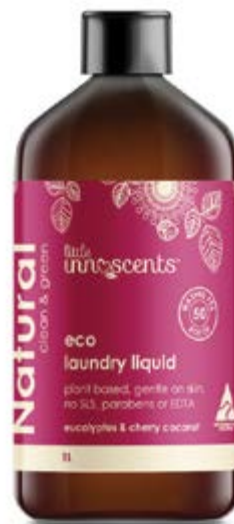
Eco Laundry Liquid RRP $14.99