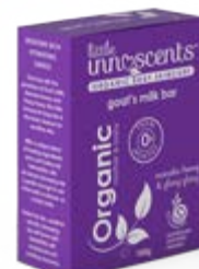
Goat's Milk Cleansing Bar RRP $3.99