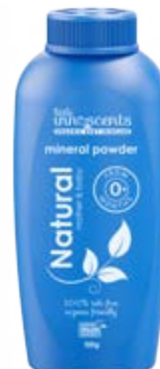
Mineral Baby Powder RRP $8.99