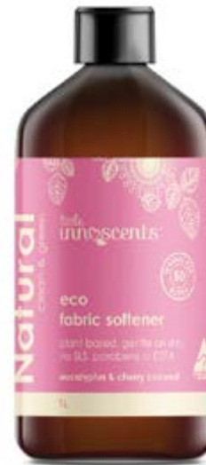
Eco Fabric Softener RRP $14.99