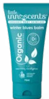
Winter Blues Vapour Balm RRP $10.99