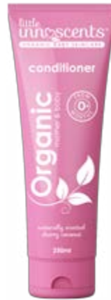
Cherry Coconut Conditioner RRP $12.99