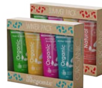
Travel Packs RRP $19.99