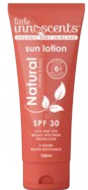
Sun Lotion SPF 30+ RRP $19.99