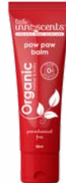
Paw Paw Balm RRP $7.95