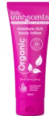
Moisture Rich Body Lotion RRP $12.99