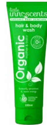
Spearmint & Orange Hair & Body Wash RRP $12.99