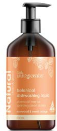
Botanical Dishwashing Liquid RRP $9.99