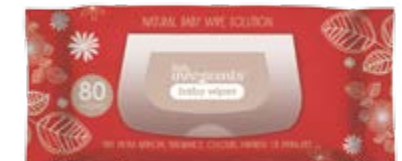
Baby Wipes RRP $6.50 3 Pack $16.99