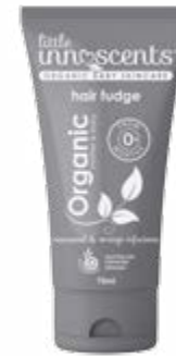
Hair Fudge RRP $10.99